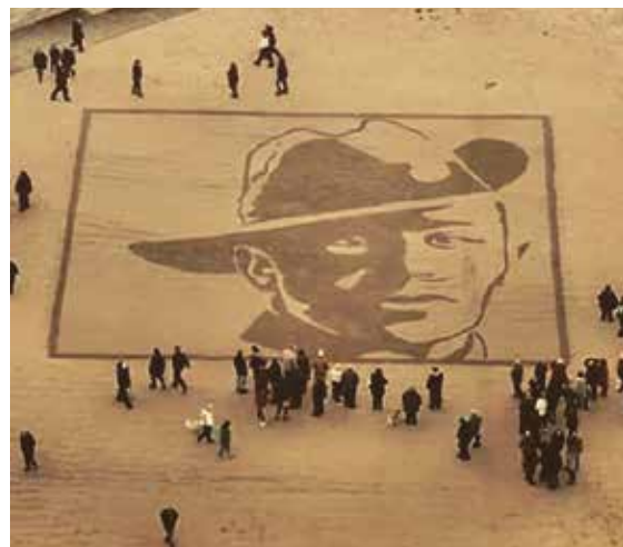
Pages of the Sea.

Whenever we create our events – big or small – we make sure they're made for and with our local communities. Creating opportunities for everyone is important to us. We make sure that exciting national events take place here, such as Pages of the Sea in 2018 and Green Space Dark Skies in 2022.