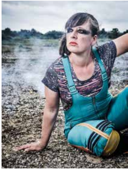
Geophonic.

Activate acts as a producer to these companies, touring their work nationally.