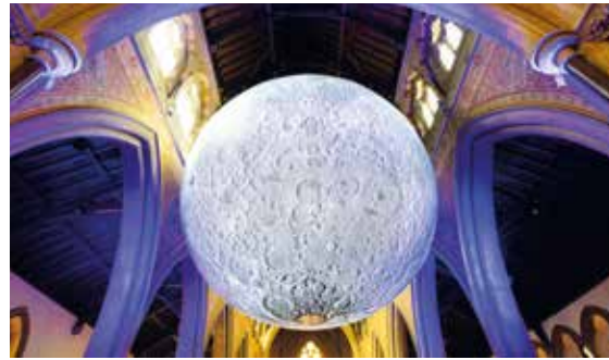
Dorset Moon.

In Dorset, we led the way in presenting the two regional events in Weymouth and Lyme Regis as part of 14-18 NOW's national arts programme. Pages of the Sea was the largest simultaneous coastal arts project to take place in the UK. Large-scale portraits were drawn into the sand on the beaches and washed away as the tide came in – representing a small selection of the millions who gave their lives to the war. An estimated 14,000 visitors attended the event in Weymouth and Lyme Regis.