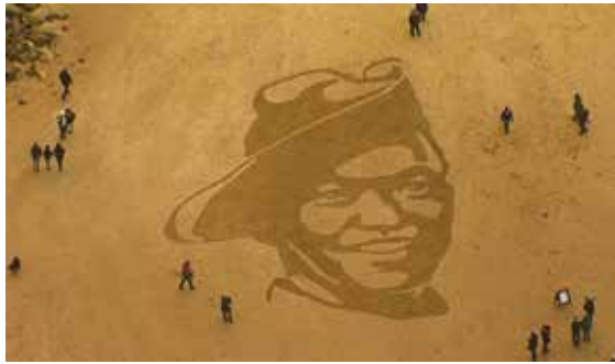
Pages of the Sea.

Outside our biennial festival, we celebrate Dorset, our natural landscape and sense of place in the alternate years through our Signature Events. Dorset's most unique urban and rural spots are transformed with extraordinary experiences in response to national moments of celebration or importance.