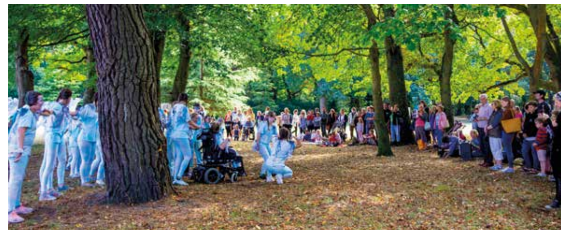
The Remix.