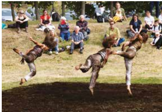
Rodadoras.