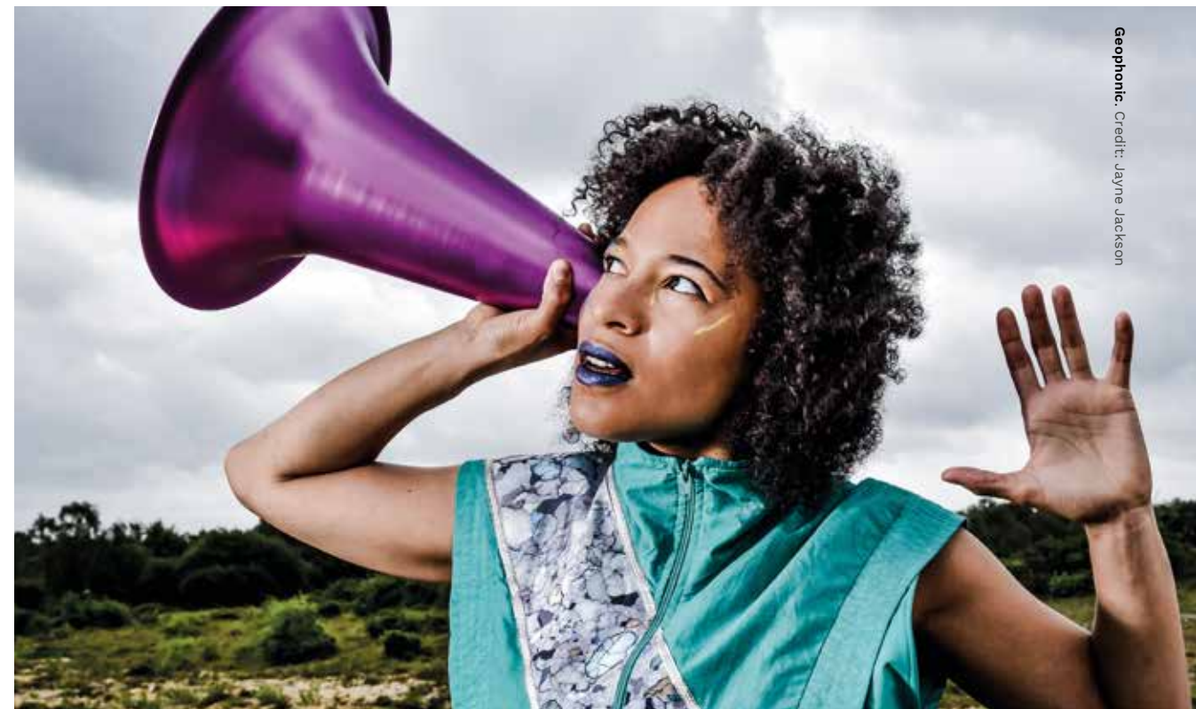
Geophonic.