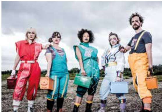
Geophonic.

As the world becomes ever more politically and socially divided, reaching out to our friends overseas remains a key ethos of our organisation. The richness and perspective our European partners bring is an essential inspiration for so many artists who we work with here in the UK.